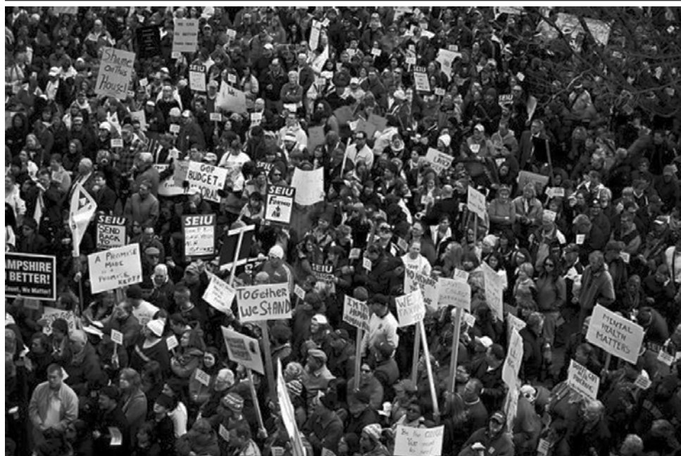
Thousands of people from every walk of life filled the State House grounds on March 31st for the "Rally for New Hampshire".