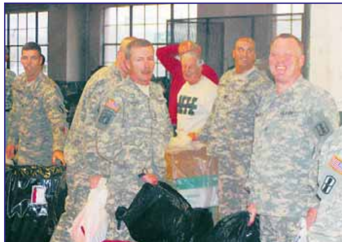
Retired SEA members and National Guard troops do their annual loading of the trucks.