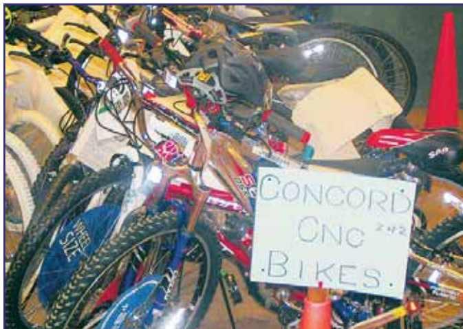
We had more room for bikes than ever before!