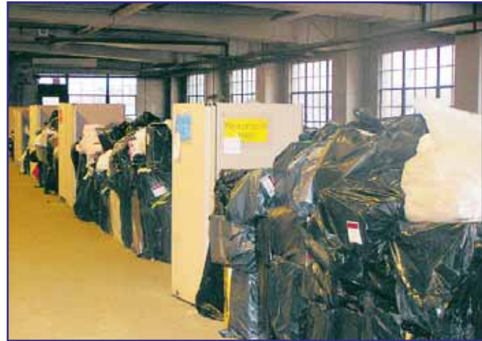
Our new headquarters at the vacant DOT highway garage on Stickney Avenue was absolutely huge. These views down the left and right sides re-create the view from the end of the building, showing the bags upon bags of gifts destined for children across the Granite State.