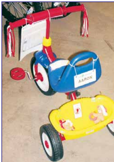
Little Aaron got a great bike!