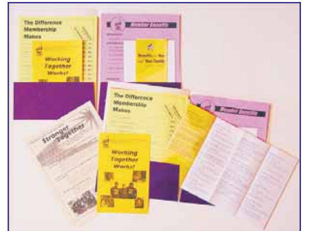
Face-to-face meetings with non-members include a packet of information about the differences between being a member and being a non-member.

SEA is the state's strongest voice for quality public services, and this is an opportunity for all state employees to join together to defend and improve